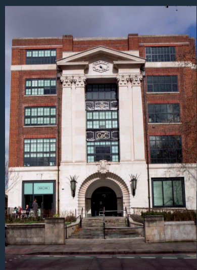
Town Hall Camberwell (15 mins by bus)