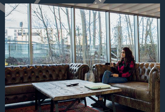
Chapter Lewisham (10 mins by bus or 25-min walk)