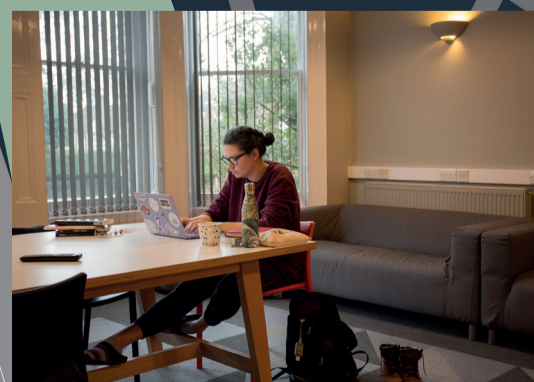
Raymont Hall (20-min walk or 15 mins by bus)