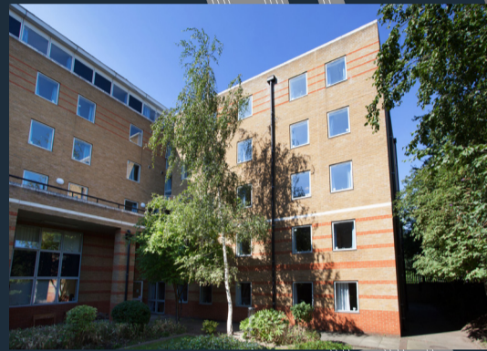
Ewen Henderson Court