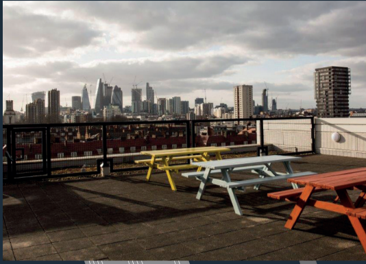
Quantum Court (20 min by train)