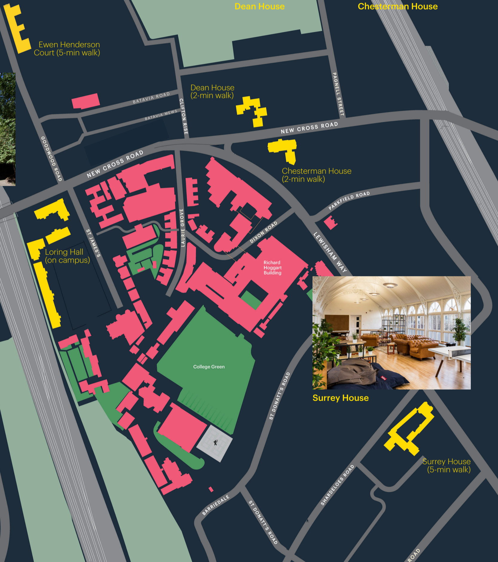
Ewen Henderson Court (5-min walk)